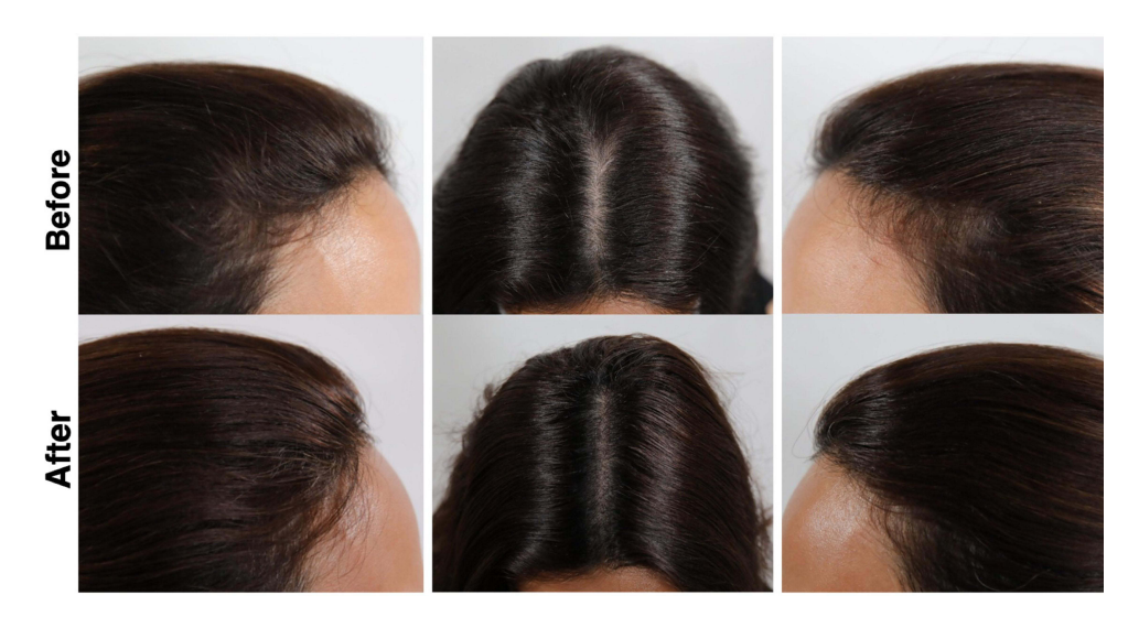
Figure 2 Pre- and post ADSC-CM clinical photography of a 39-year-old female patient showing an aesthetic improvement of the midline and bitemporal areas. The figures have been used with written consent of the patient.